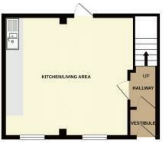
GROUND FLOOR 327 sq.ft. (30.4 sq.m.) approx.