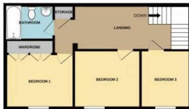
TOTAL FLOOR AREA : 819 sq.ft. (76.1 sq.m.) approx.

Whilst every attempt has been made to ensure the accuracy of the floorplan contained here, measurements of doors, windows, rooms and any other items are approximate and no responsibility is taken for any error, omission or mis-statement. This plan is for illustrative purposes only and should be used as such by any prospective purchaser. The services, systems and appliances shown have not been tested and no guarantee as to their operability or efficiency can be given. Made with Homopix v2020