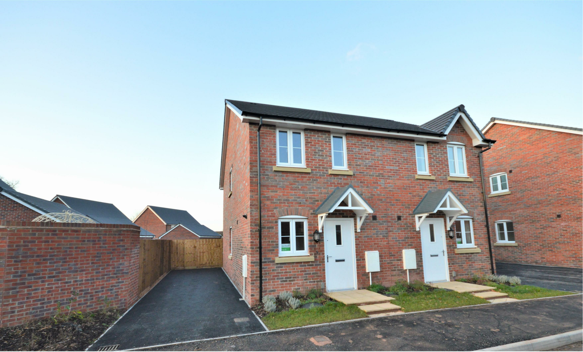
Plot 9 Kingstone Grange Kingstone, Hereford, Herefordshire, HR2 9HJ