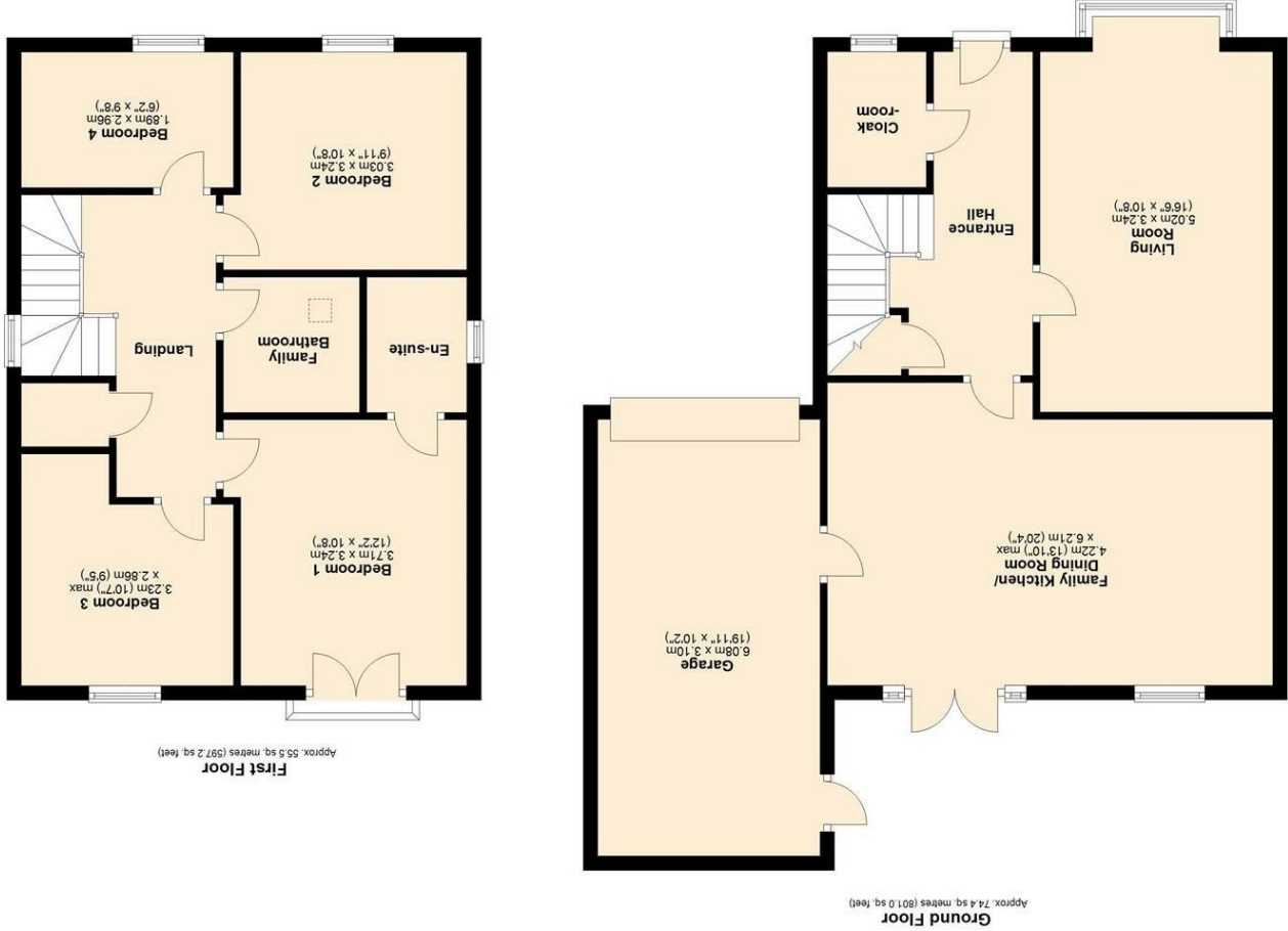
7 St Marys Walk, Kingsland, Leominster Total area: approx. 129.9 sq. metres (1398.2 sq. feet) These Plans are for Identification and Reference Only. Plan produced using PlanUp.

Jackson International - for themselves and the owners/landlords of the property, whose agents they are, give notice that these particulars, although believed to be correct, do not constitute any part of an offer of contract, that all statements contained in these particulars as to this property are made without responsibility and are not to be relied upon as statements or representations of fact and that they do not make or give any representation or warranty whatsoever in relation to this property. Any intending purchaser/tenant must satisfy himself by inspection or otherwise as to the correctness of each of the statements contained in these particulars.