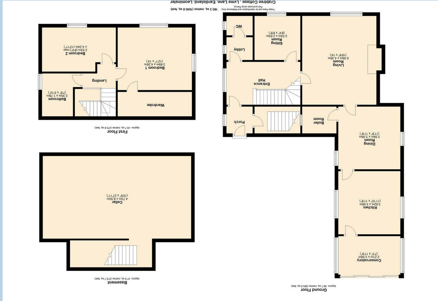
Crabtree Cottage, Lyme Lane, Eardisland, Leominster Plans produced using Planity.

Jackson International - for themselves and the owners/landlords of the property, whose agents they are, give notice that these particulars, although believed to be correct, do not constitute any part of an offer of contract, that all statements contained in these particulars as to this property are made without responsibility and are not to be relied upon as statements or representations of fact and that they do not make or give any representation or warranty whatsoever in relation to this property. Any intending purchaser/tenant must satisfy himself by inspection or otherwise as to the correctness of each of the statements contained in these particulars.