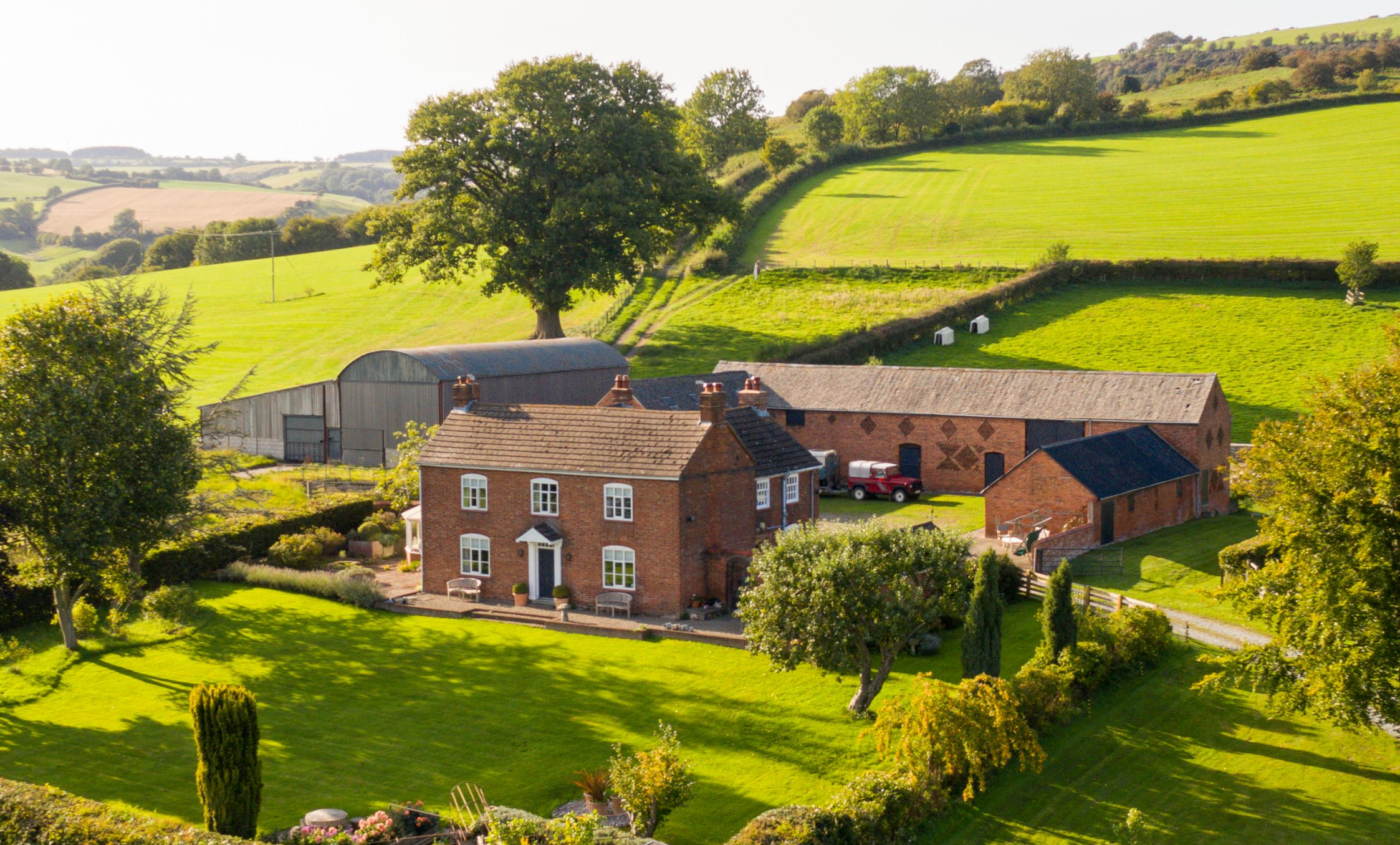
Beechfield Farm Worthen, Shropshire