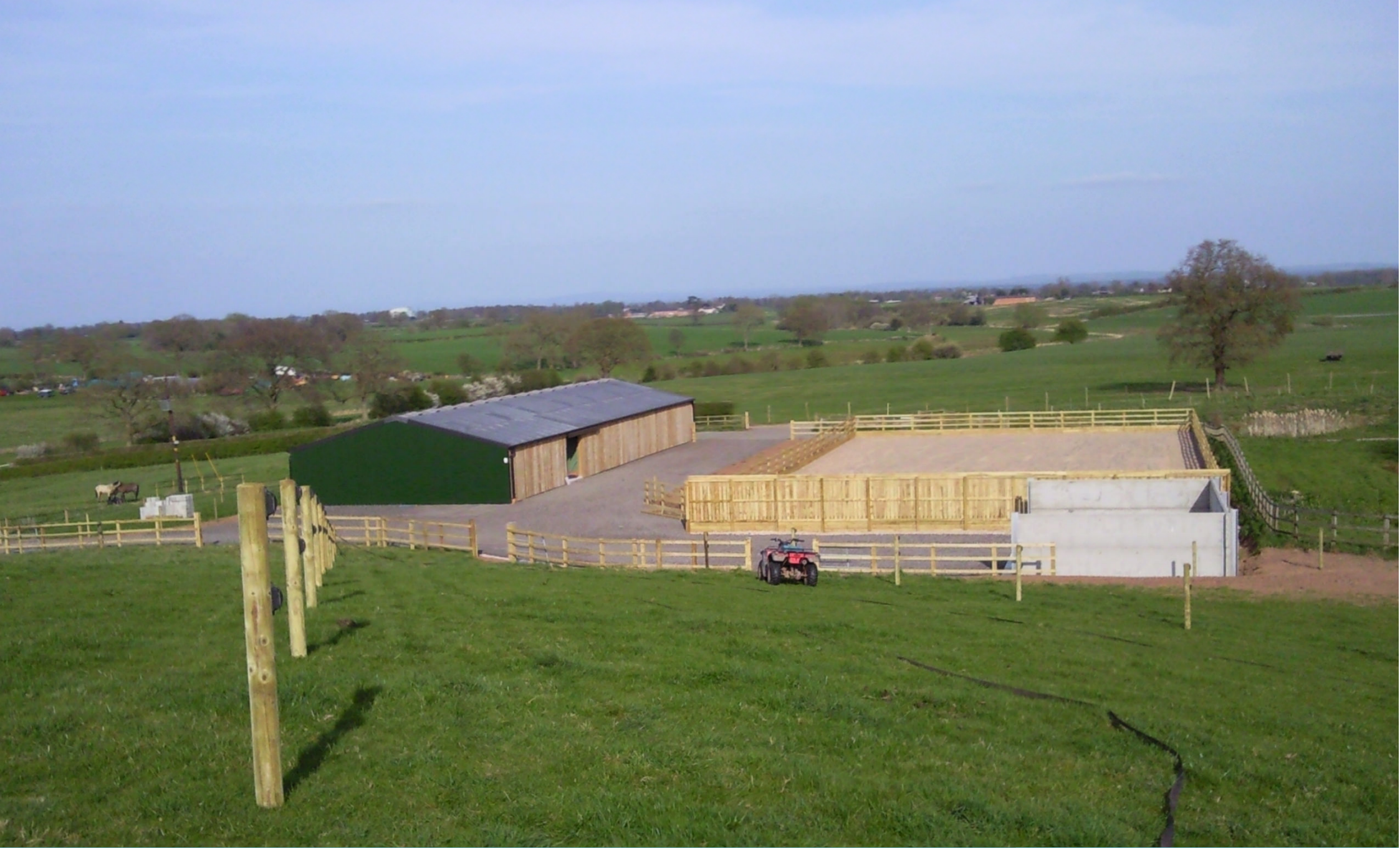
Hawksbill Hall Equestrian Centre (Lot 3) Wrenbury, Cheshire