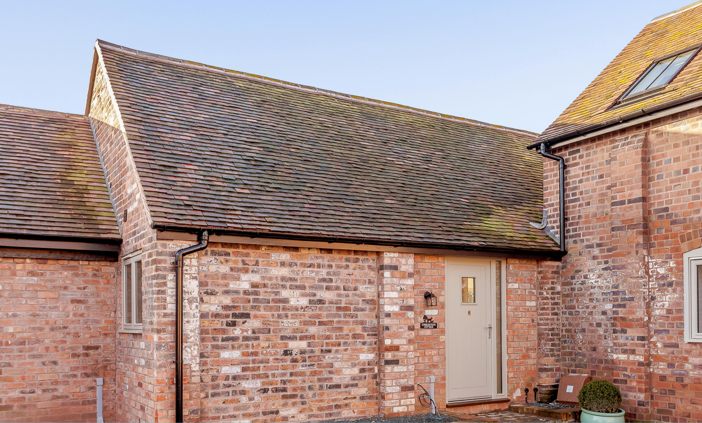
Cobblestone Cottage Shifnal, Shropshire