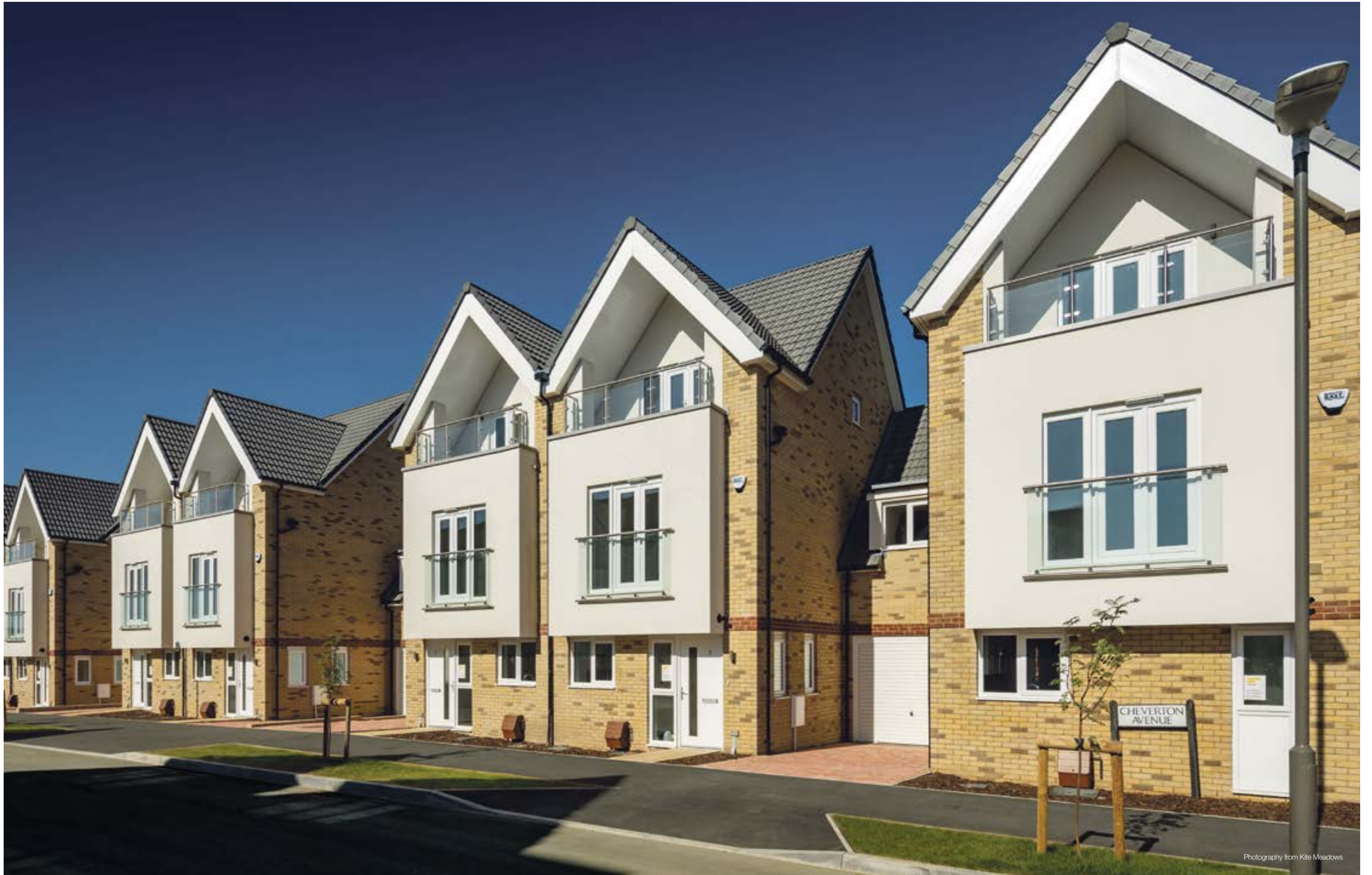
Photography from Kite Meadows