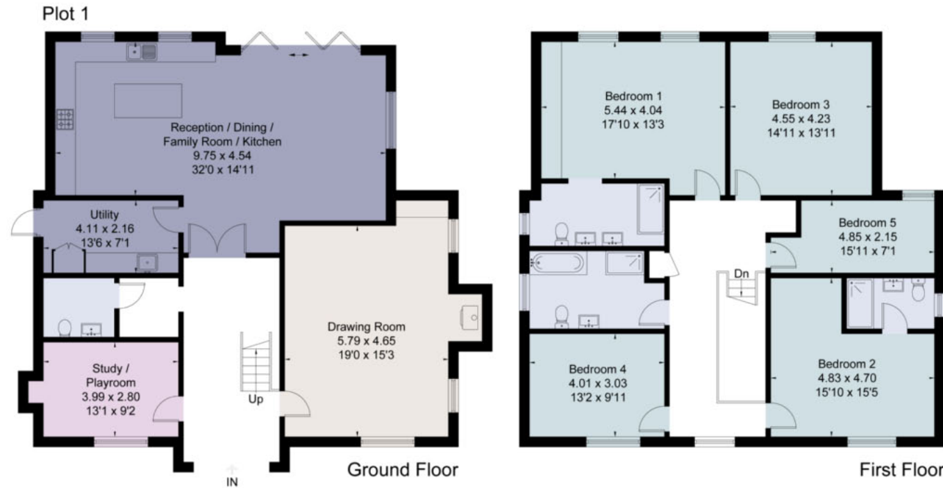
Surveyed and drawn in accordance with the International Property Measurement Standards (IPMS 2: Residential) fourwalls-group.com 255969

Kingshills Estate Agents 01494 939868 hello@kingshills.co.uk kingshills.co.uk