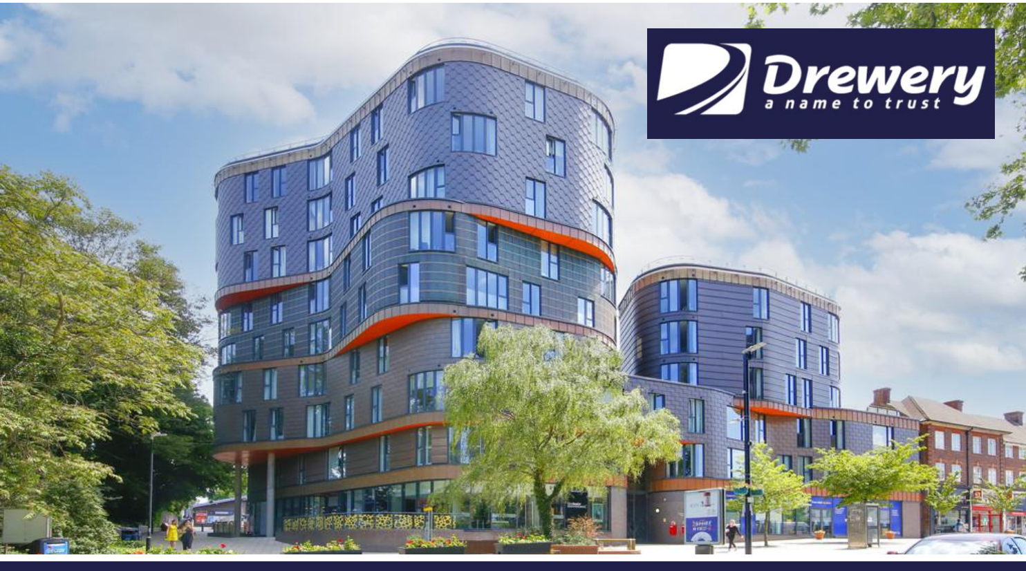
9 Saxby Apartments, Station Road, Sidcup, DA15 7AH £945 pcm