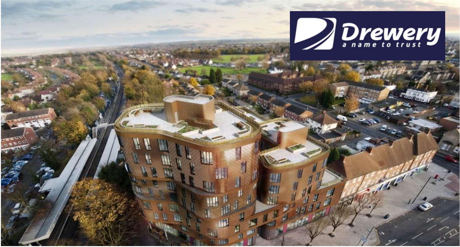
14 Saxby Apartments, Station Road, Sidcup, Kent, DA15 7AH £1,345 pcm