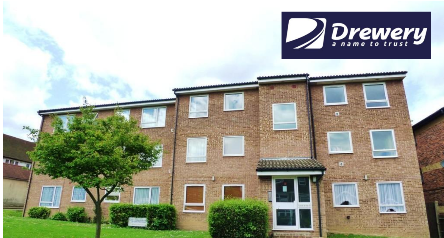
7 Beavers Lodge, Carlton Road, Sidcup, Kent, DA14 6TU £1,200 pcm