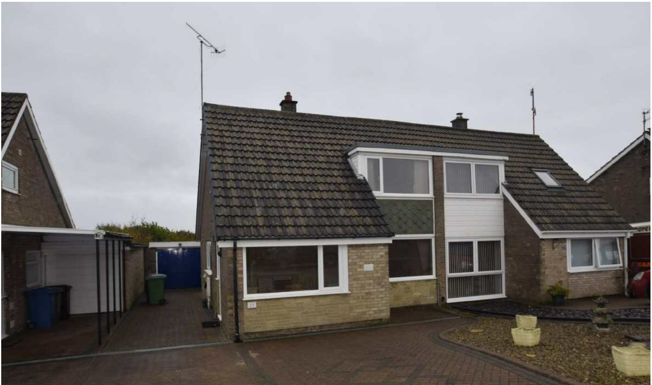
27 Rydal Crescent Crossgates YO12 4JJ

Whilst every attempt has been made to ensure the accuracy of the floor plan contained here, measurements of doors, windows, rooms and any other items are approximate and no responsibility is taken for any error, omission, or mis-statement. This plan is for illustrative purposes only and should be used as such by any prospective purchaser. The services, systems and appliances shown have not been tested and no guarantee as to their operability or efficiency can be given. Made with Metropix ©2019