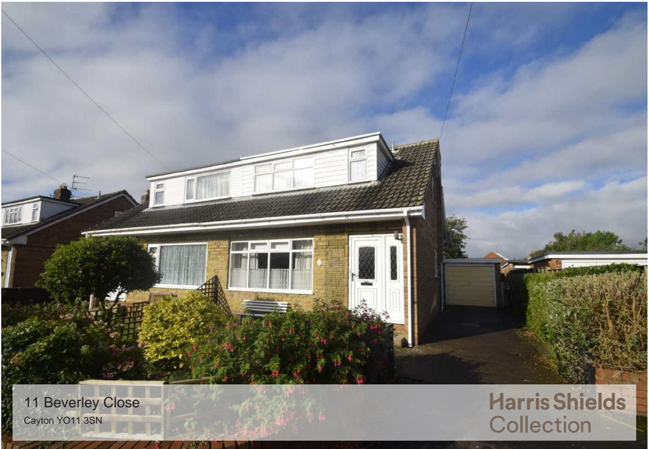
11 Beverley Close Cayton YO11 3SN