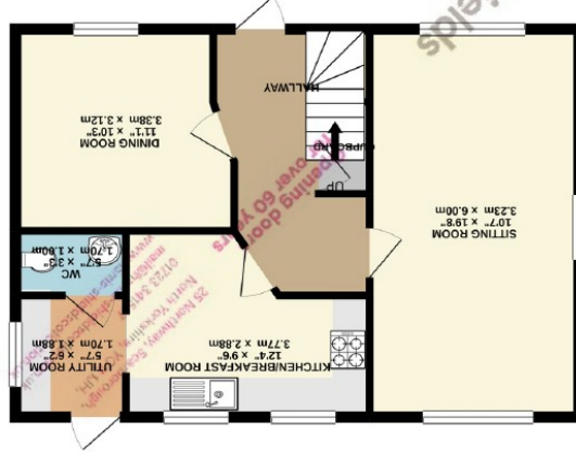
GROUND FLOOR 563 sq.ft. (52.3 sq.m.) approx.