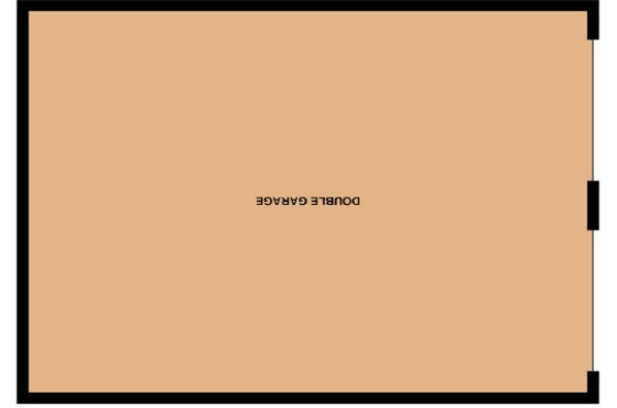
GARAGE BELOW HOUSE 563 sq.ft. (52.3 sq.m.) approx.