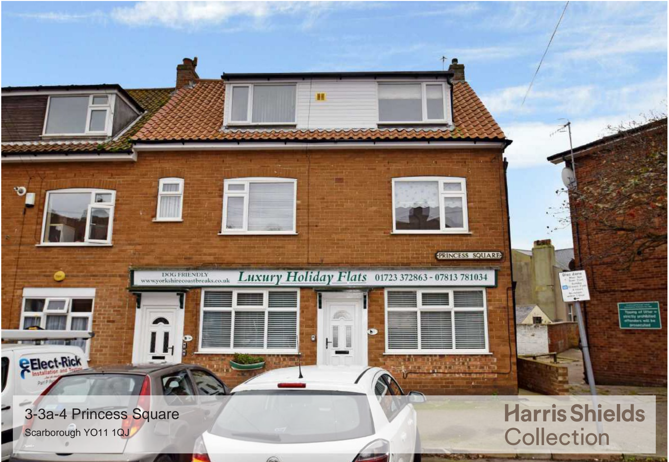
3-3a-4 Princess Square Scarborough YO11 1QJ