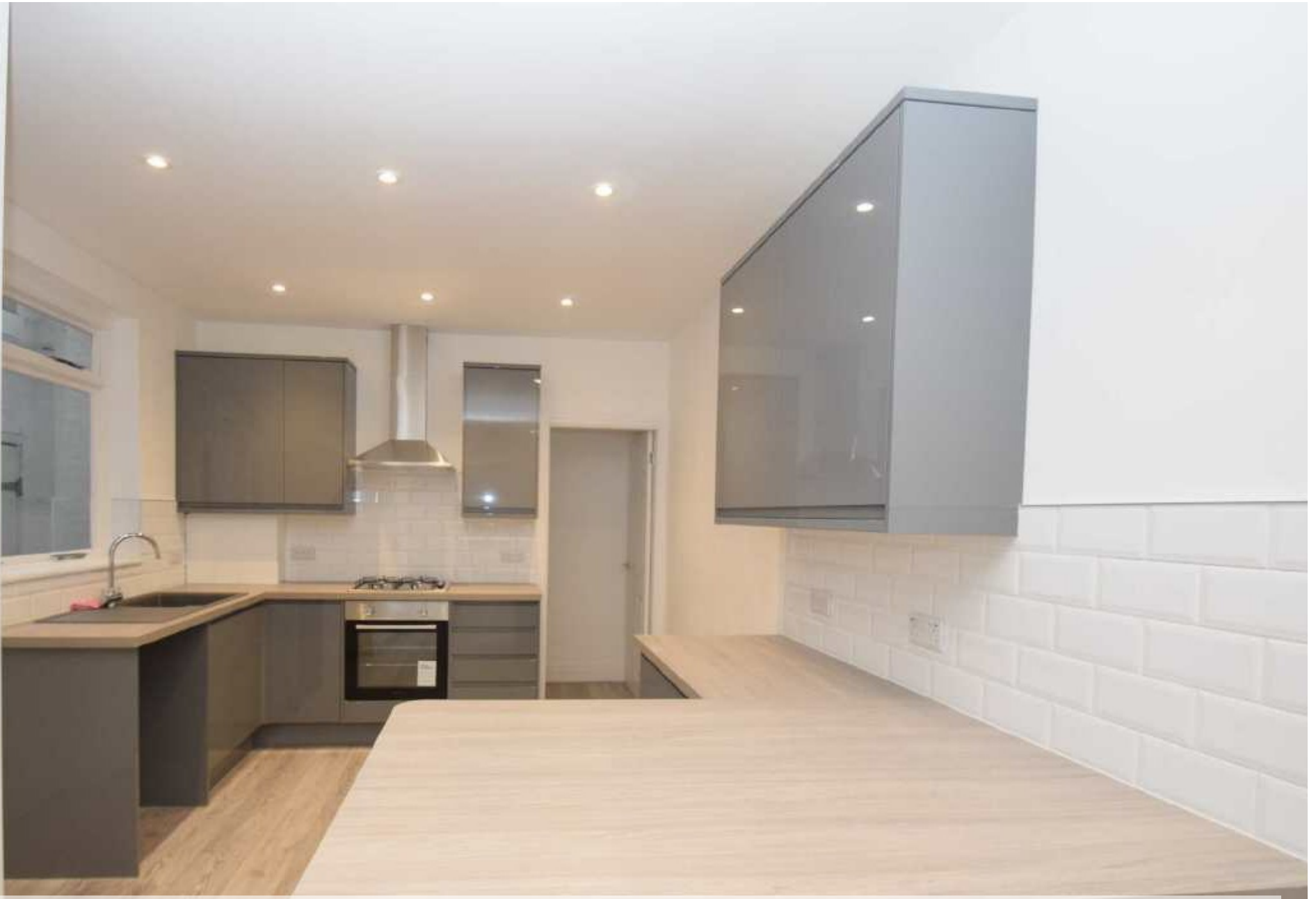
Lower Ground Floor Apartment, 31 West Street Scarborough YO11 2QR