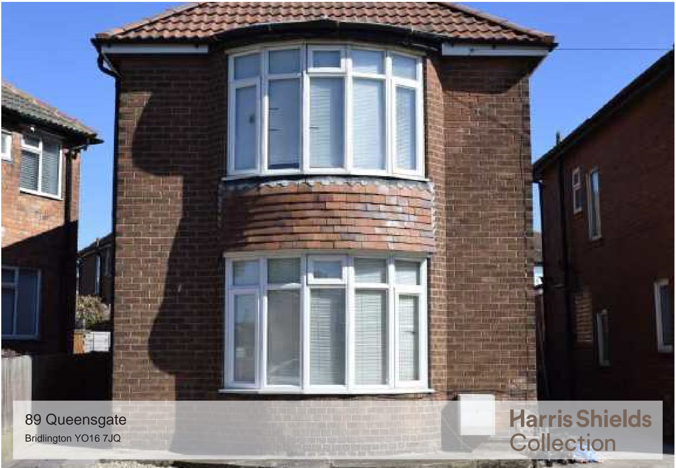
89 Queensgate Bridlington YO16 7JQ