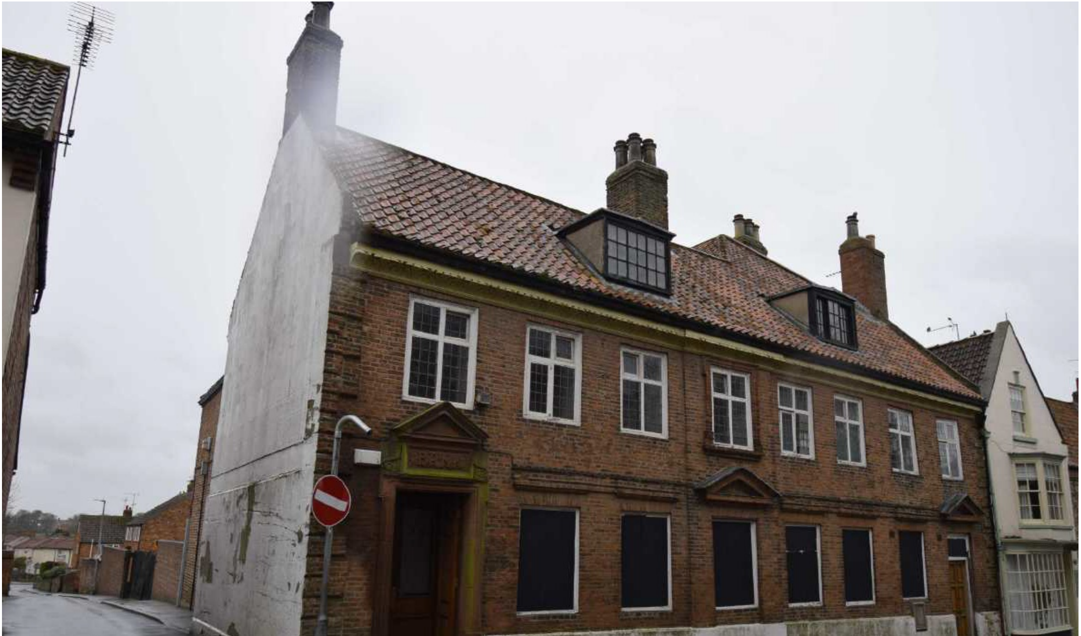
Hebblewaith House, 7 Westgate Bridlington YO16 4QF