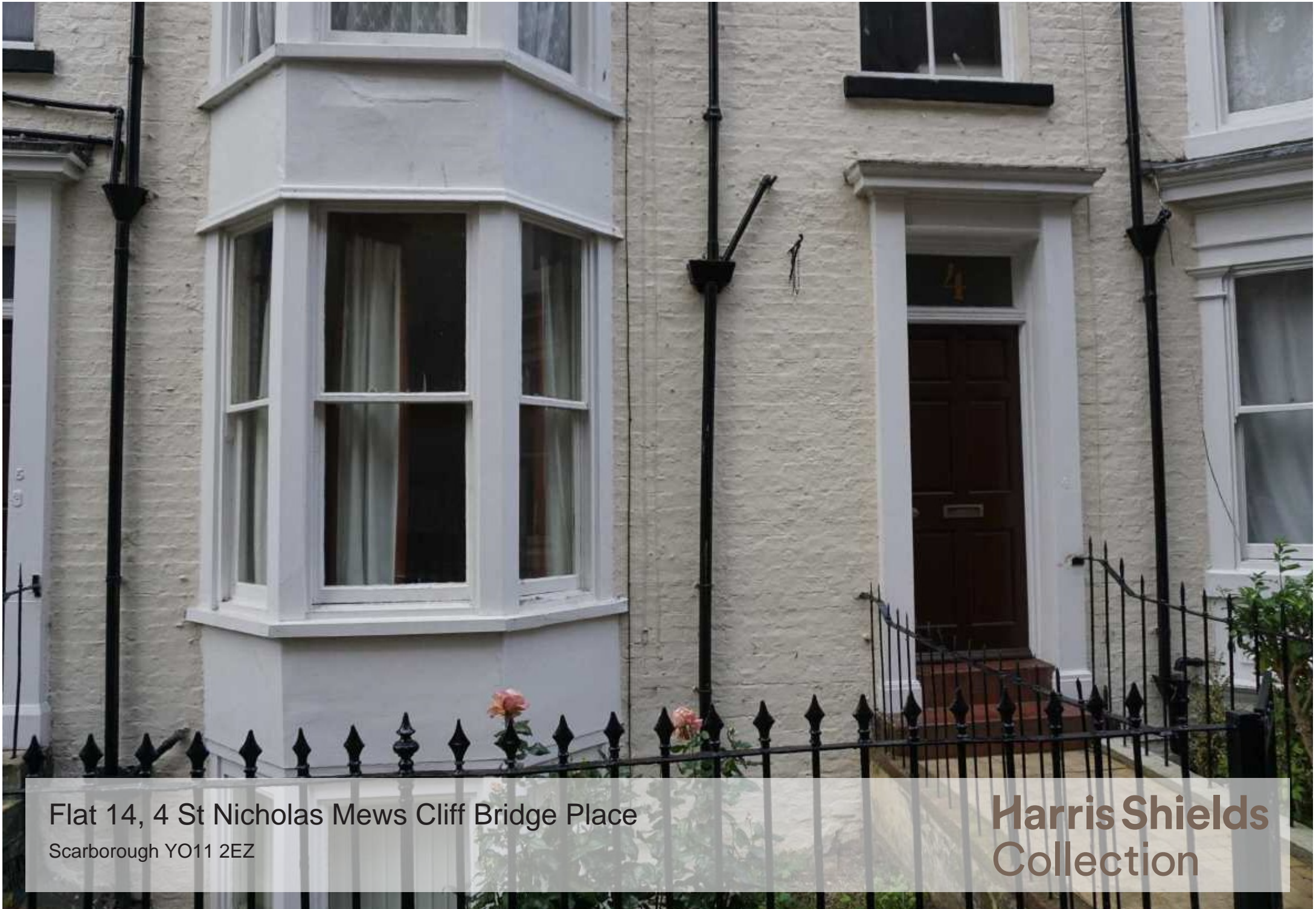
Flat 14, 4 St Nicholas Mews Cliff Bridge Place Scarborough YO11 2EZ