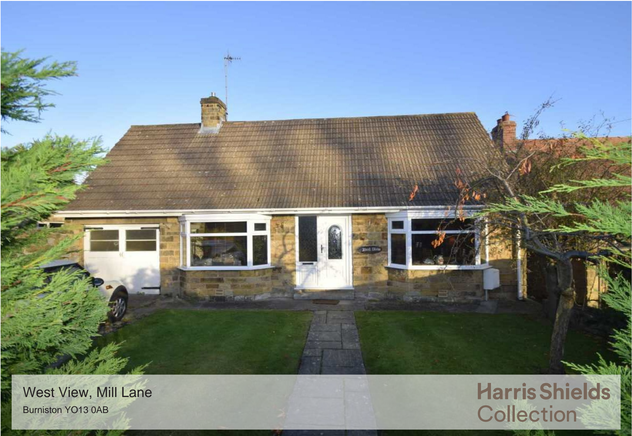
West View, Mill Lane Burniston YO13 0AB