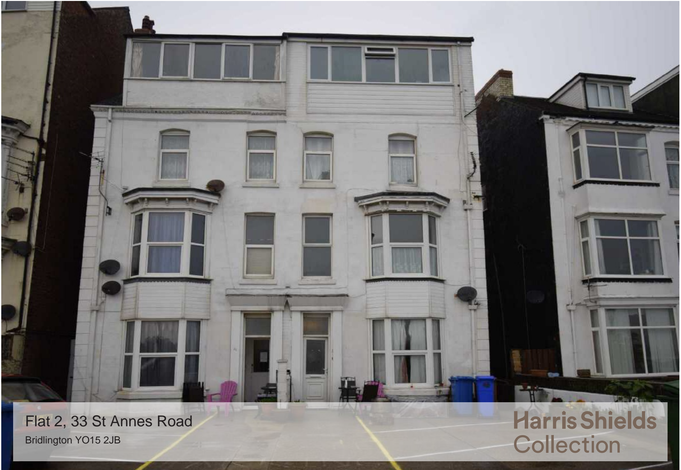
Flat 2, 33 St Annes Road Bridlington YO15 2JB