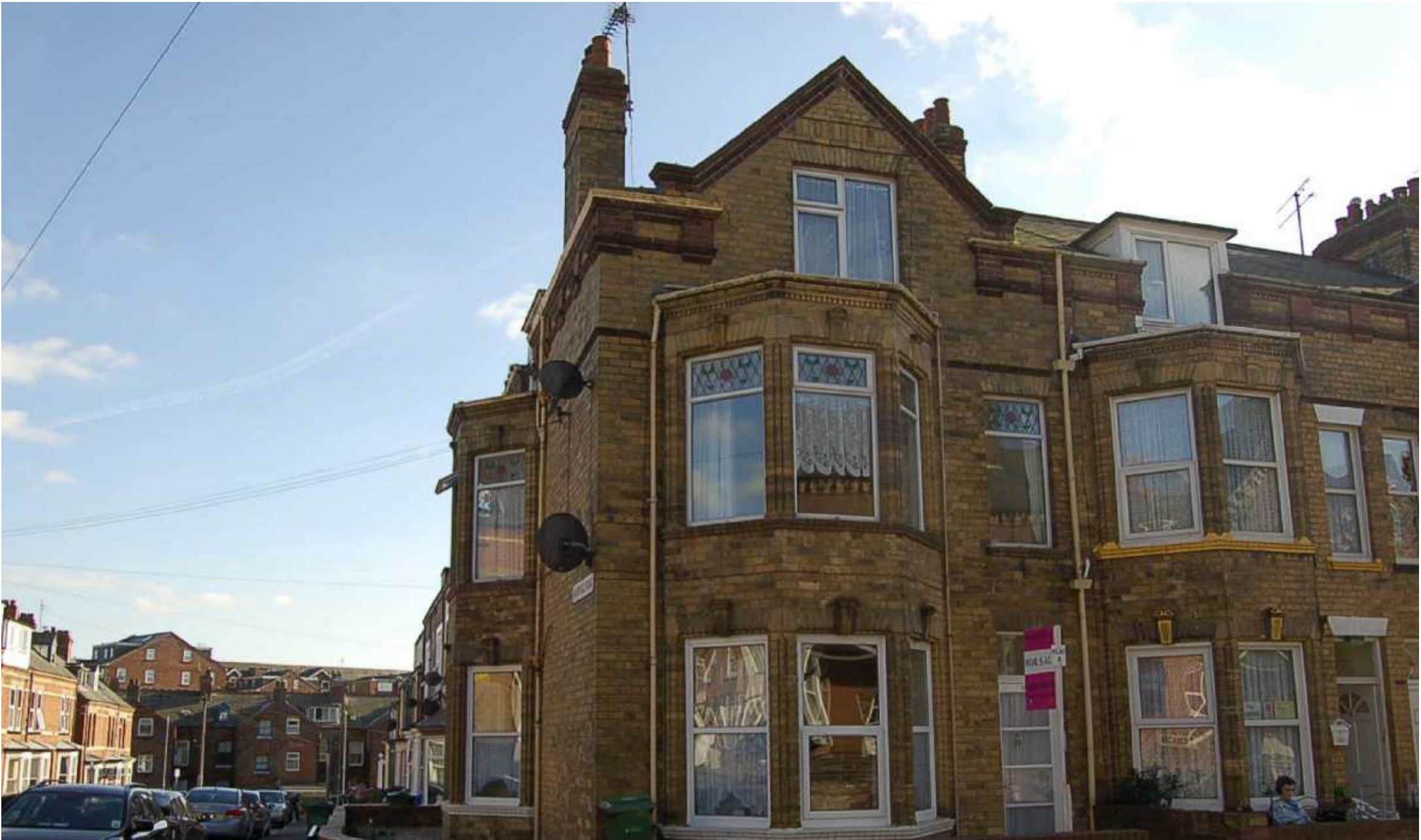
Flat 3, 9 Richmond Street Bridlington YO15 3DL