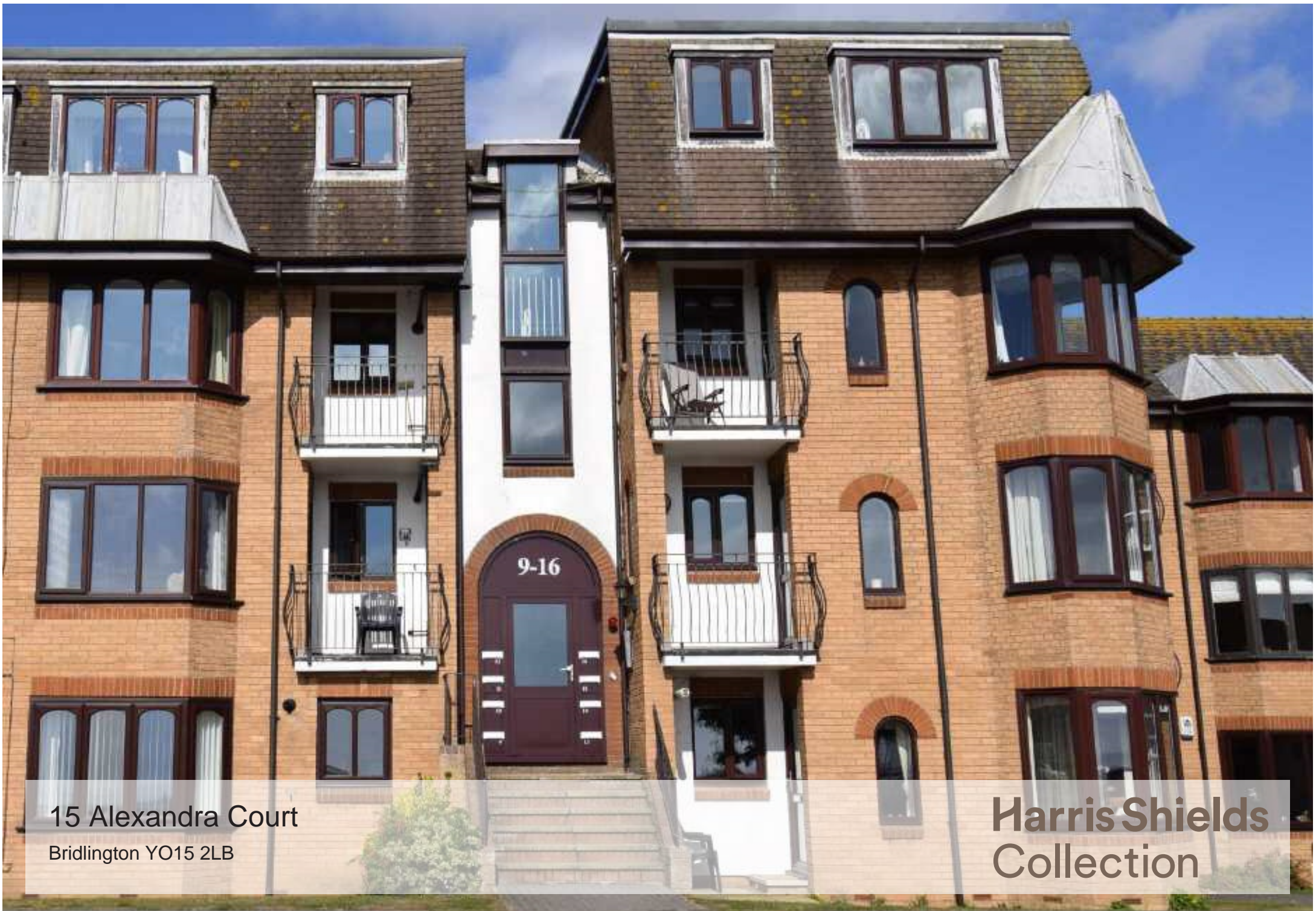
15 Alexandra Court Bridlington YO15 2LB