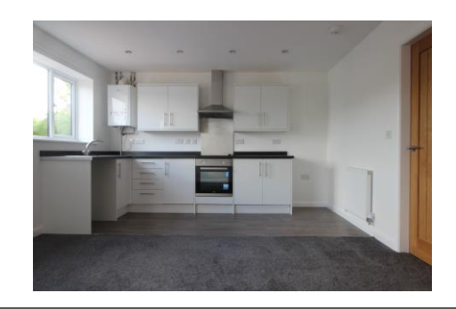
44b, Hallam Road, New Ollerton, NG22 9TL Monthly Rental Of £675.00

Open Plan Kitchen/Lounge Bedroom One Bedroom Two Bathroom