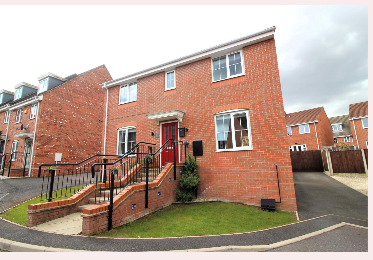
What a beauty.....