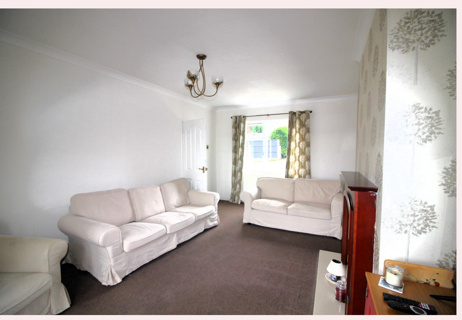
Four bedroom Family Home In A Desirable Village Location.