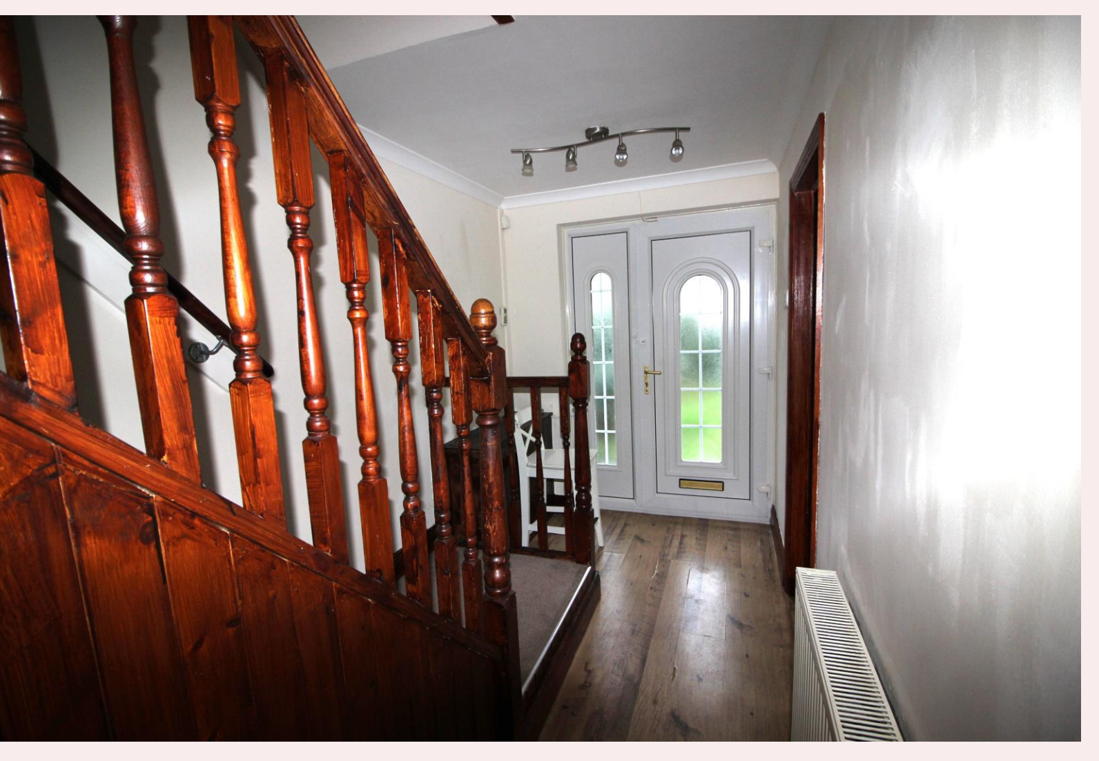
A spacious property on a large plot...