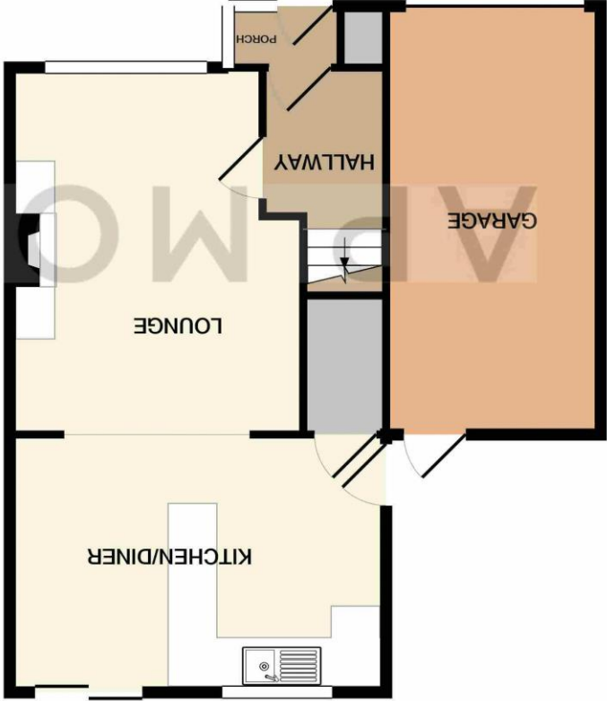
GROUND FLOOR APPROX. FLOOR AREA 552 SQ.FT. (51.3 SQ.M.)

A professional removal company takes the stress out of moving. Knowing that your belongings are safe and insured far outweighs any small savings by trying to do it yourself or using a man-and-a-van service. We work closely with and recommend Cube Removals as the leading local firm. For peace of mind and a reliable service call them on 0800 193 0000 or visit their website, cuberemovals.co.uk , to arrange a survey.