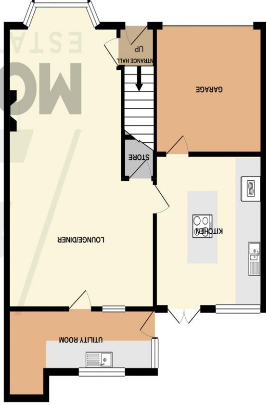
GROUND FLOOR 643 sq.ft. (59.7 sq.m.) approx.