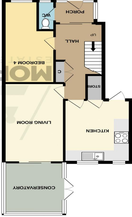
GROUND FLOOR 631 sq.ft. (58.6 sq.m.) approx.