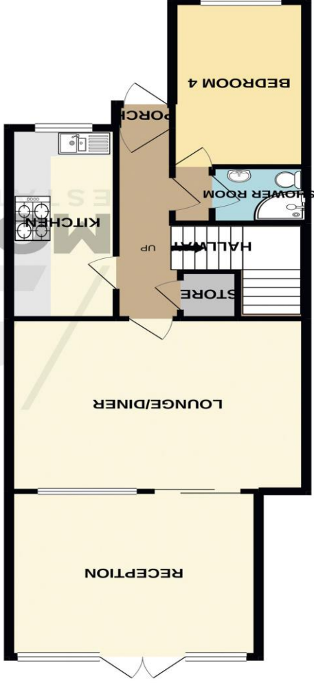
GROUND FLOOR 741 sq.ft. (68.8 sq.m.) approx.