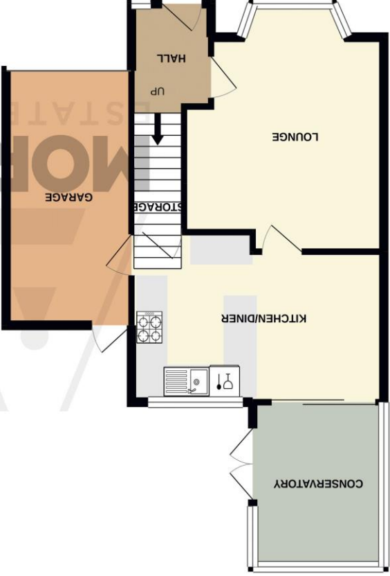
GROUND FLOOR 578 sq.ft. (53.7 sq.m.) approx.