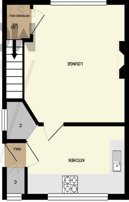
GROUND FLOOR 295 sq.ft. (27.4 sq.m.) approx.

A professional removal company takes the stress out of moving. Knowing that your belongings are safe and insured far outweighs any small savings by trying to do it yourself or using a man-and-a-van service. We work closely with and recommend Cube Removals as the leading local firm. For peace of mind and a reliable service call them on 0800 193 0000 or visit their website, cuberemovals.co.uk , to arrange a survey.