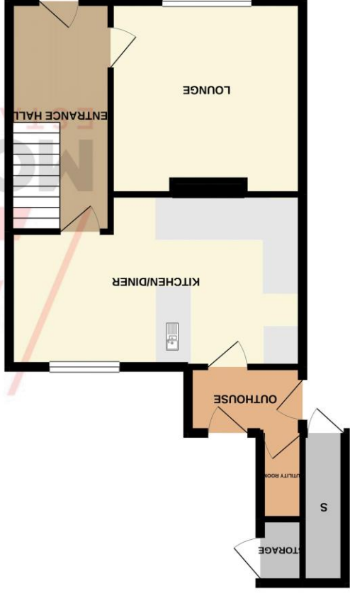
GROUND FLOOR 489 sq. ft. (45.5 sq.m.) approx.