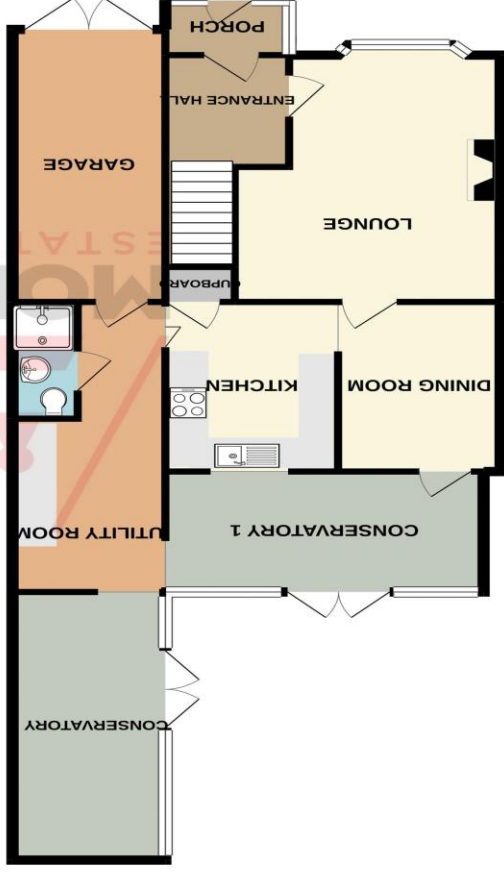
GROUND FLOOR 963 sq. ft. (89.5 sq. m.) approx.