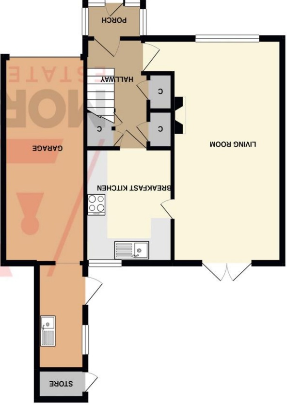
GROUND FLOOR 643 sq. ft. (59.7 sq. m.) approx.