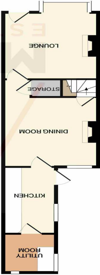
GROUND FLOOR APPROX. FLOOR AREA 426 SQ.FT. (39.6 SQ.M.)

A professional removal company takes the stress out of moving. Knowing that your belongings are safe and insured far outweighs any small savings by trying to do it yourself or using a man-and-a-van service. We work closely with and recommend Cube Removals as the leading local firm. For peace of mind and a reliable service call them on 0800 193 0000 or visit their website, cuberemovals.co.uk , to arrange a survey.